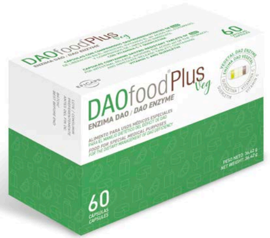
Food for Special Medical Purposes

The Diamine Oxidase (DAO) contained in DAOfood ® Plus Veg serves as a supplement to the same enzyme found naturally in the body, which is responsible for metabolizing histamine. Taking one tablet of DAOfood ® Plus Veg before each meal increases the amount of DAO in the small bowel and therefore also boosts histamine degradation. This accelerates the processing in the digestive tract of the histamine found in different foods which is the root cause of the symptoms. Quercetin and Vitamin C are two active ingredients that act as adjuvants on the dietary management of DAO deficiency.